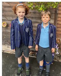
Avocets: Noah and Bertie