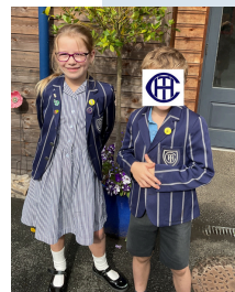
Barn Owls: Keira and Val