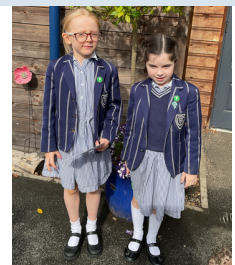
Peregrines: Phoebe and Georgia