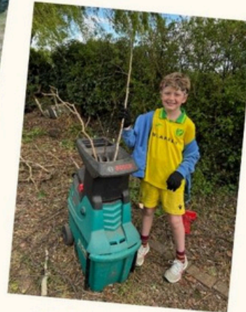
MAKING OWN WOODCHIP FROM FALLEN BRANCHES