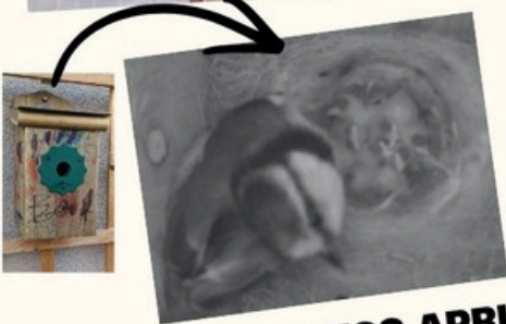
LAST YEAR FOR ECO APRIL DECORATED A BIRD BOX..... THIS YEAR - EGGS AND CHICKS!