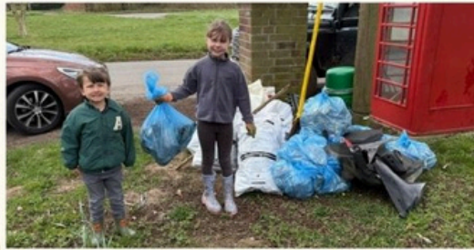
A FEW OF OUR LITTER PICKING CHAMPIONS!