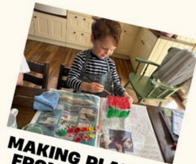
MAKING PLANTERS FROM RECYCLING