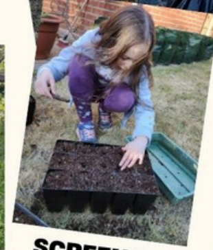
SCREENING HOMEMADE COMPOST & GROWING FOOD