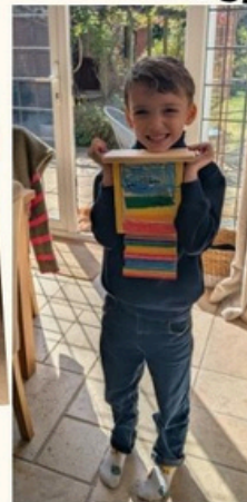
BUILT AND DECORATED A BAT BOX