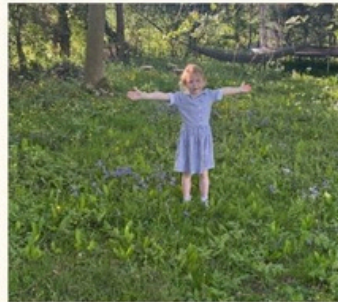
'NO MOW' AREA TO ENCOURAGE BIODIVERSITY