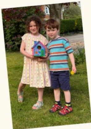
DECORATING A BIRD BOX