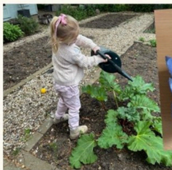
GROWING OWN FRUIT & VEG